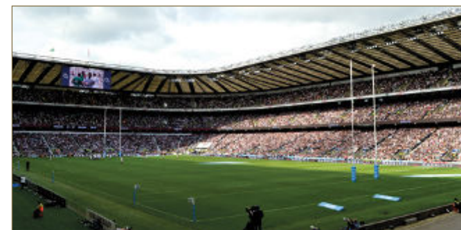
View from seat

Guests will enjoy a Champagne reception, four-course lunch and complimentary drinks, plus a guest speaker pre-match to really ramp up the atmosphere before the action starts.