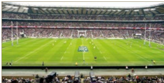
View from seat

Real ales and draft lager or fine wines specially selected by our in-house sommelier will perfectly complement your menu choice. You and your guests can enjoy a five course taster menu, light bites or an informal tapas-style service in the company of rugby legends.