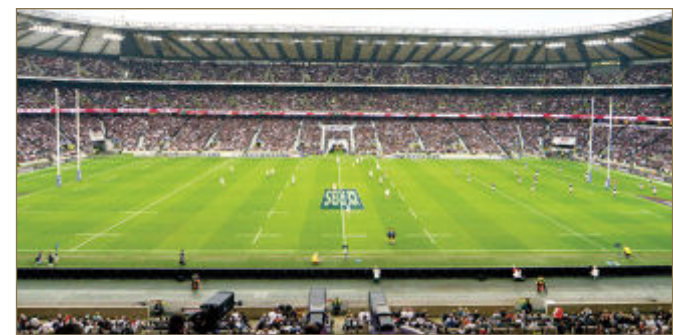
View from seat

Cask ales and draft lager or fine wines specially selected by our in-house sommelier will perfectly complement your menu choice. You and your guests can enjoy a la carte fine dining, light bites or an informal tapas-style service in the company of rugby legends.