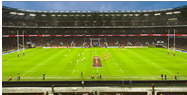
View from seat

Real ales and draft lager or fine wines specially selected by our in-house sommelier will perfectly complement your menu choice. You and your guests can enjoy a five course taster menu, light bites or an informal tapas-style service in the company of rugby legends.