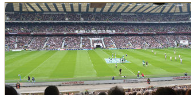
View from seat

Once the final whistle has gone, return to The Lock and talk through the day's play, alongside rugby legends and heroes of the game.