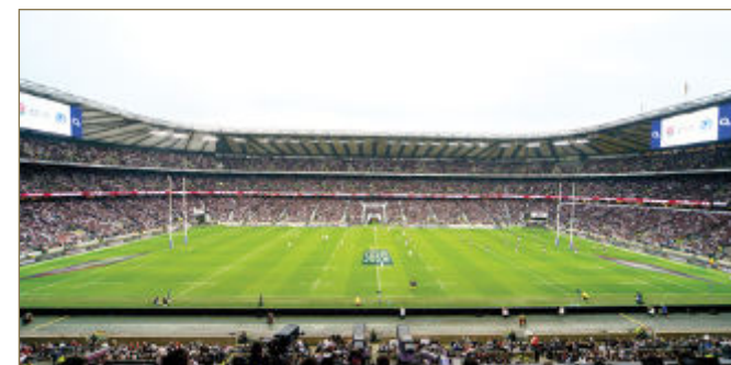
View from seat

Continue to enjoy the hospitality on offer at half time. Post-match snacks are served in The Rose Garden for up to an hour after the final whistle, giving you and your guests time to compare the team's performance with like-minded rugby fans while the crowds disperse.